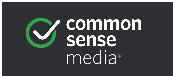
Reverse color: on black or dark gray