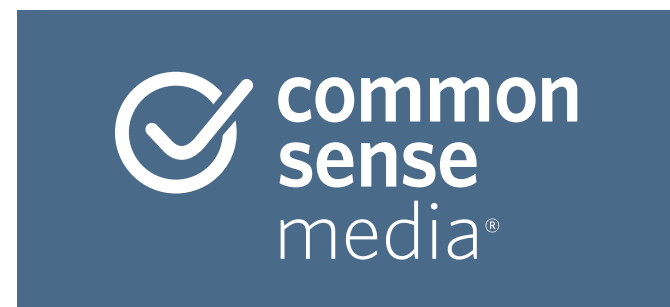
Reverse white: on color or photo