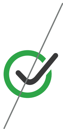
Use only part of the logo